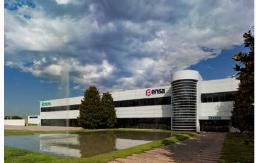
Martorelles Plant – Barcelona, Catalonia, Spain

Pellet, capsule, tablet, liquid, ointment, etc.